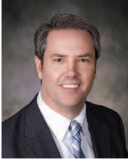
by Wayne Price