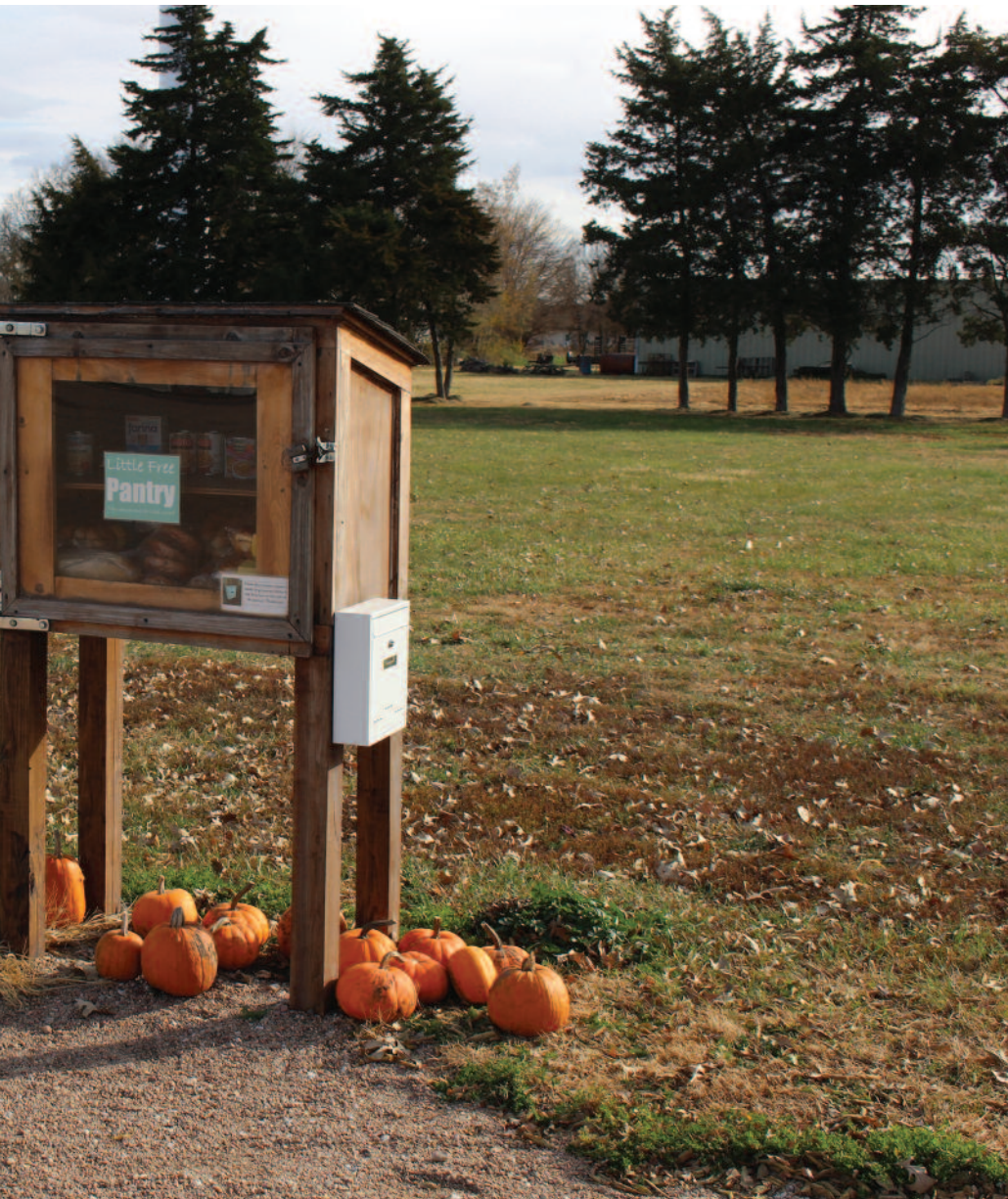
Opposite: Jamie Olson restocks the Little Free Pantry.