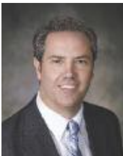
by Wayne Price