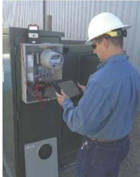
Many lineworkers use tablets to perform their duties.

One of my personal favorites in terms of lineworker tech is the forward-looking infrared camera, also known as FLIR. You may be