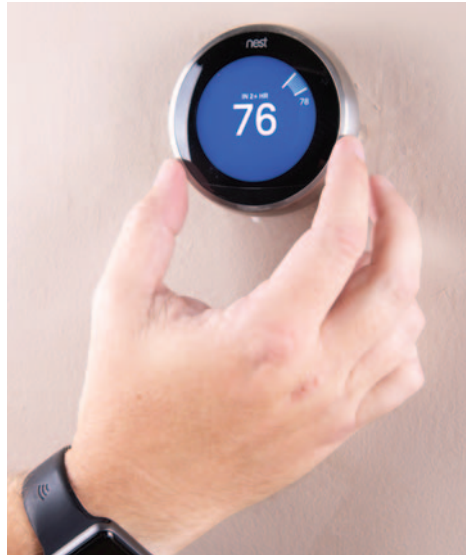
Keeping your thermostat at the highest comfortable temperature will save energy and money.

Covering and sealing windows may seem like a wintertime efficiency practice, yet these help in the summer, too. Windows are typically the least-insulated surface in a room. Add weatherstripping to form a tight seal and curtains you can close during the hottest times of the day to block out the sun.