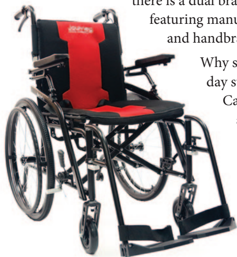
Available in Black (shown), White or Blue

Why spend another day struggling? Call now and a helpful,